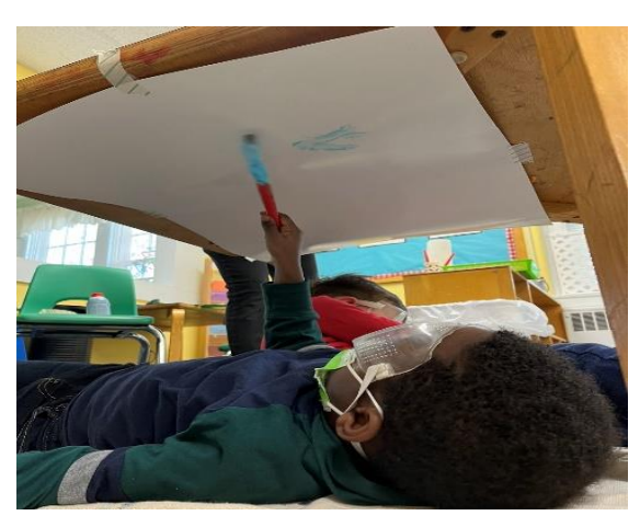
Working on a group art project