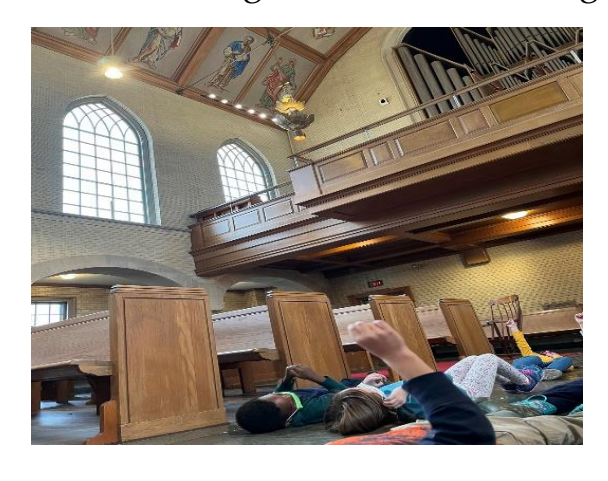
Gaining inspiration from the Nave ceiling

Happy Spring Everyone! As we enter a new season, we look forward to all of the wonderful changes taking place around us. It is an exciting time to explore the great outdoors and look for signs of emerging life. The Preschool Class frequently takes walks in the neighborhood, around the church grounds and recently visited Institute Park. Signs of spring are everywhere! The Pre-K class is learning about artists from the past, and trying out different art materials and techniques. Many of the art pieces that both classes will create this year will be featured at our Art Show on June 3<sup>rd</sup>. You will be hearing more about this exciting event in the coming months.